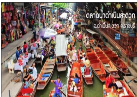
Damnernsaduak Floating Market

Tour Excluded: Personal expenses / Option Tour